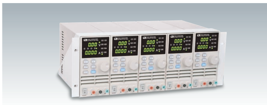
IT-E152 19" rack mount diagram