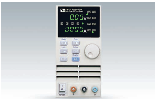
IT6720 60V/5A/100W IT6721 60V/8A/180W