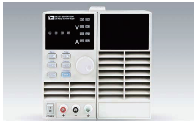
Rear panel of IT6720/6721